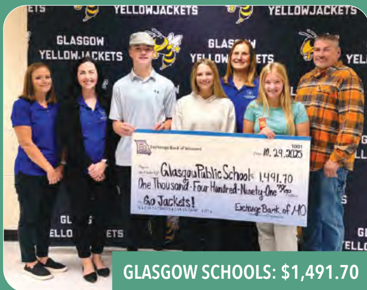
GLASGOW SCHOOLS: $1,491.70