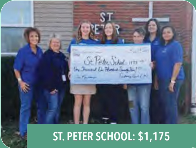
ST. PETER SCHOOL: $1,175