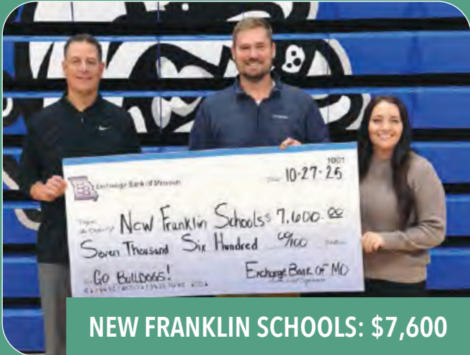
NEW FRANKLIN SCHOOLS: $7,600