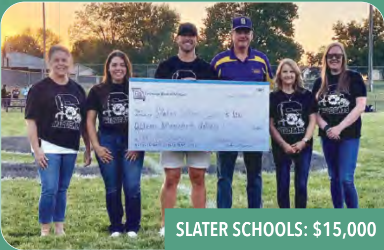
SLATER SCHOOLS: $15,000