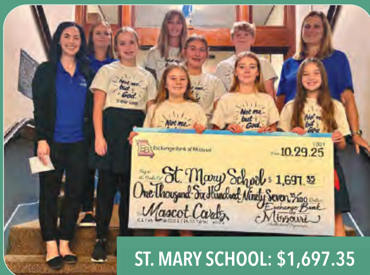
ST. MARY SCHOOL: $1,697.35