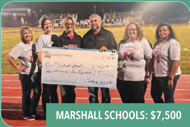
MARSHALL SCHOOLS: $7,500

This holiday season, we're celebrating more than just the spirit of giving, we're celebrating the spirit of community! Through our Mascot Debit Card Program, EBMO customers are making a difference simply by using their debit cards. Each transaction helps support local schools and gives back to the students who represent our future. We were thrilled to deliver checks to our participating schools this year, a moment of pride for students, staff, and our team alike. Thank you for helping us cheer on our schools and keep our communities thriving!