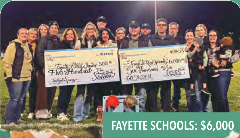
FAYETTE SCHOOLS: $6,000