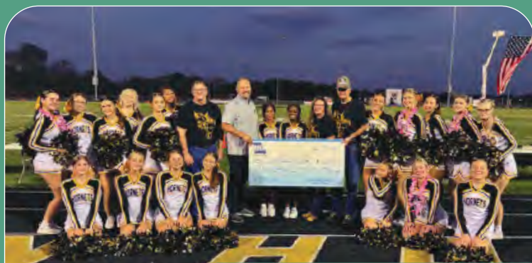
FULTON SCHOOLS: $3,000