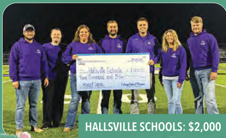
HALLSVILLE SCHOOLS: $2,000